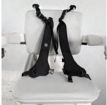
Not all options are shown.